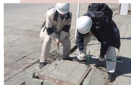
Investigation into damage to sewers (Matsushima, Miyagi Prefecture, Mar. 24)

The mission of the disaster prevention experts was to collect, as rapidly as possible, and subsequently to report, information about the state of damage to public works facilities, etc., and to give support to the country and municipalities as volunteers in response to the disaster. As these members have been engaged in the arrangement and management of public works facilities, they have much experience and expertise. 358 members (as of Mar. 31, 2011) were registered at our association.