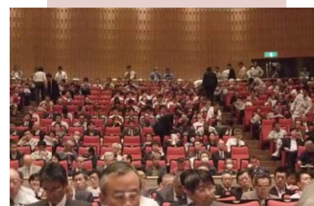
Scientific research in Tohoku -1st report meeting (Apr. 28)