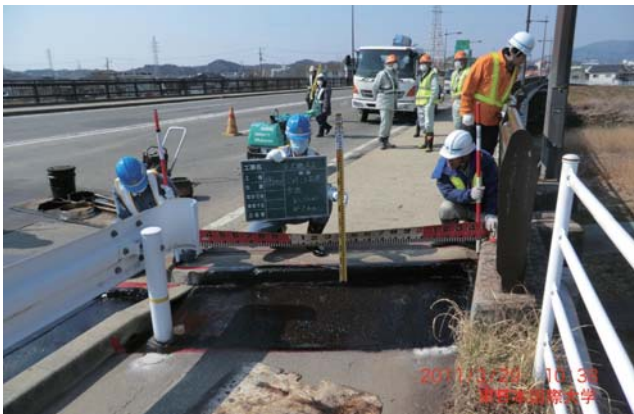
Investigation into damage on Route 6 (Mar. 29)