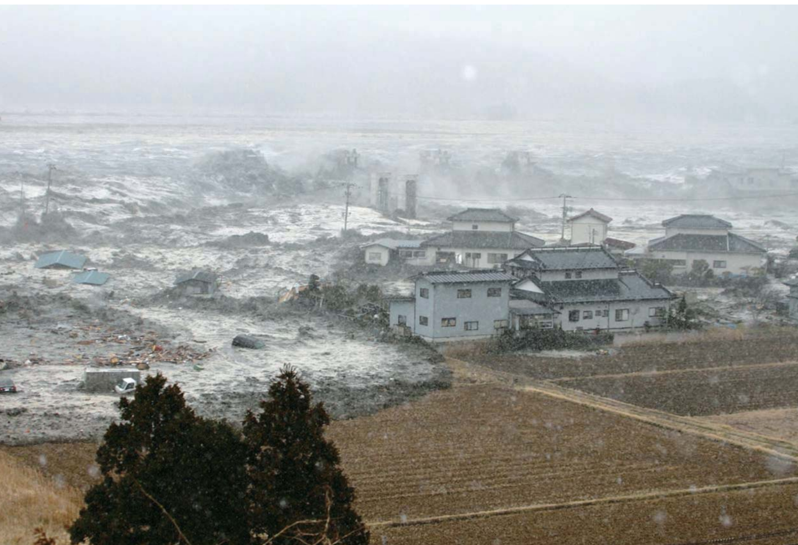
Ishinomaki, Miyagi Prefecture near the mouth of the Kitakami River