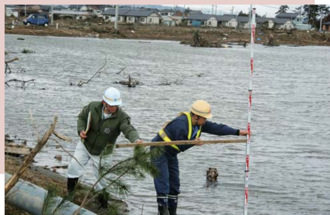
Investigation into the state of flooding(Mar.17)