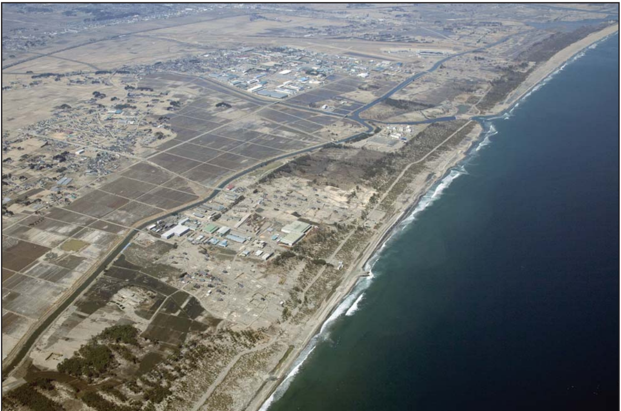
April 17, 2011