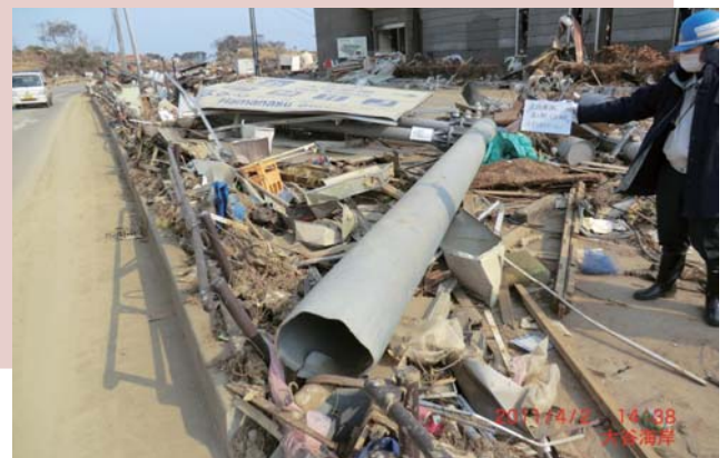
Investigation into damaged historic ruins (Apr. 2)