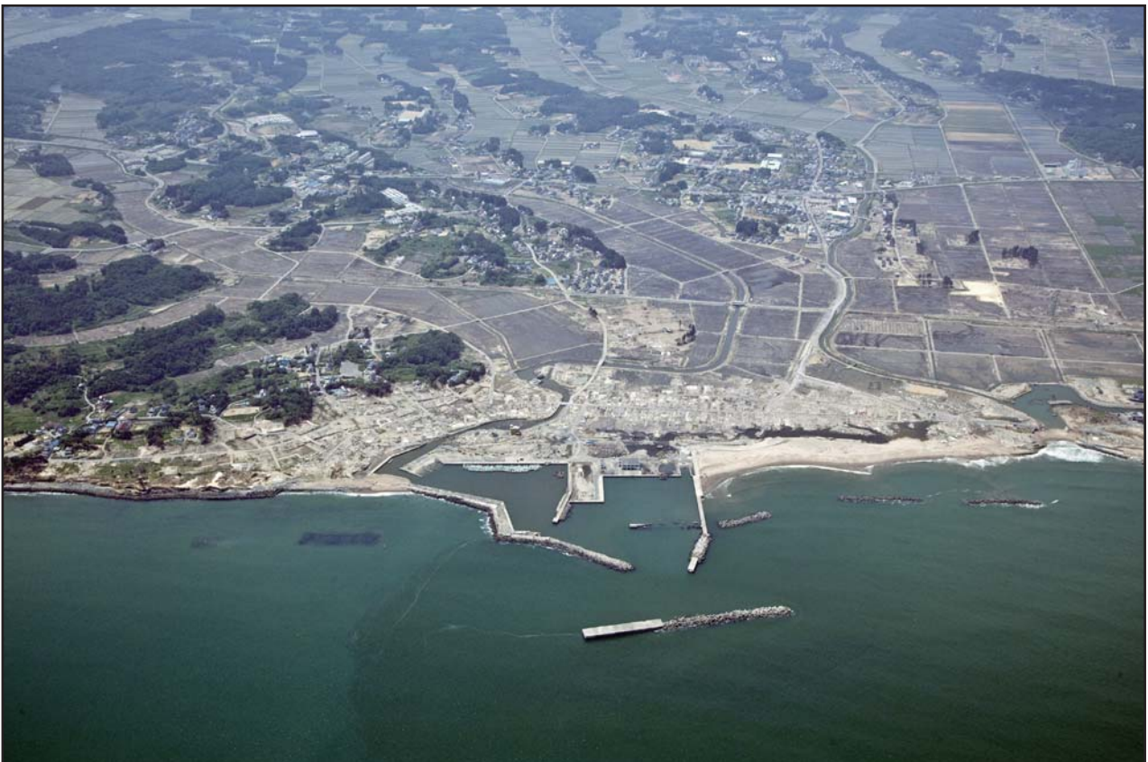
June 6, 2011