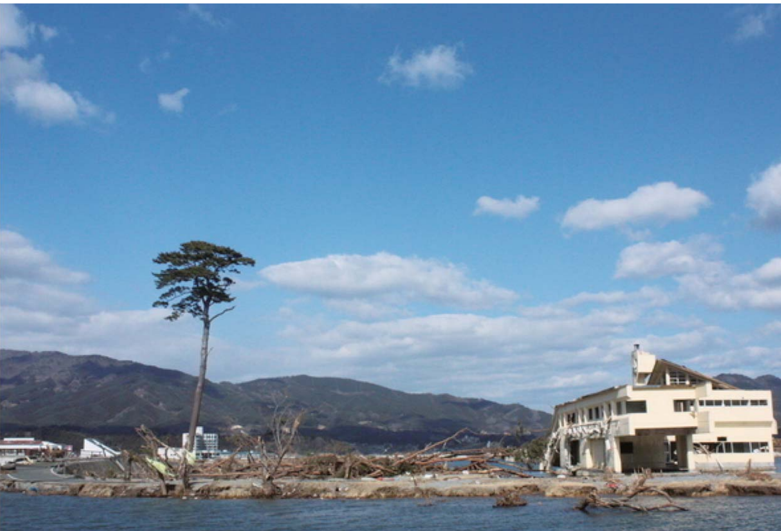
「Kibouno-Matsu」 Rikuzentakata City, Iwate Prefecture