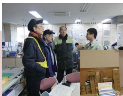
Help for the liaison officers in Kesenuma (Apr.29)