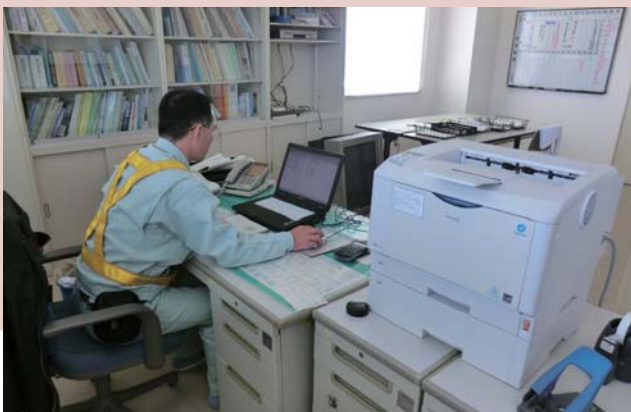
Reporting the emergency recovery construction (Mar. 24)