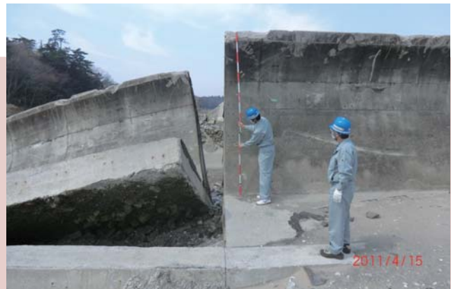
Investigation into the tsunami damage (Yamamoto Apr. 15)