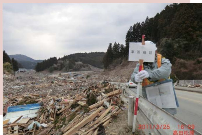
Investigation into traces of the tsunami (Mar.25)