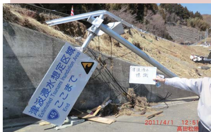
Investigation into damages on Route 45 and investigation into the structures which still remain in spite of the disaster (Apr. 1)