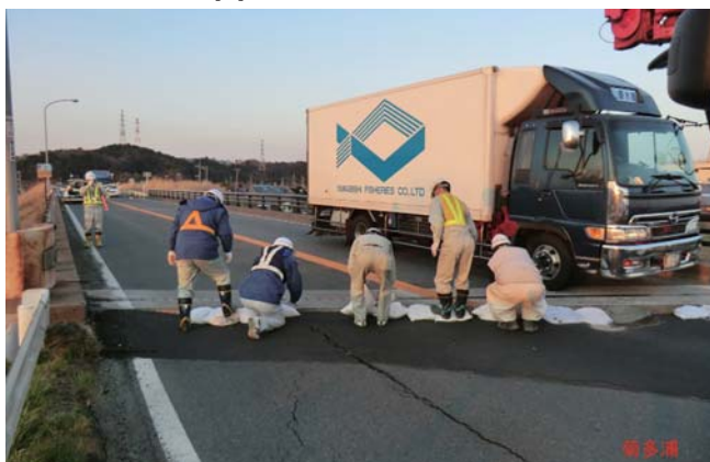
Running restoration work of bumps on Route6 (Apr.12)