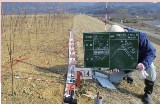
Investigation into damages of Ichinoseki protective basin(Mar.13)