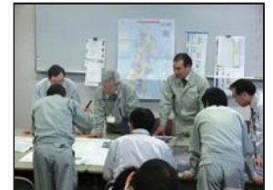
Disaster Prevention and Countermeasures Headquarters