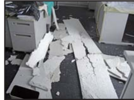
Damage of the Tohoku Construction Association